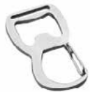
A26 Metal hook with bottle opener

Material: metal Width (mm): 20 Available colors: shiny silver Possible printing: none