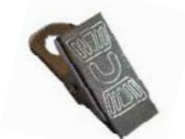
A41 Metal clip

Material: Metal Width (mm)/ size: 10 Available colors: silver Possible printing: none