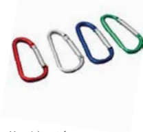
A30 Climber hook

Material: metal Size (mm): 55 Available colors: Red, silver, blue, green Possible printing: none