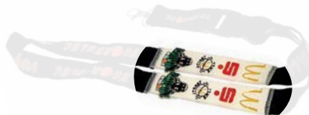
A35 Dublex insert

Material: PVC Width (mm): 20 Available colors: any Pantone Minimum quantity: 1000 pcs