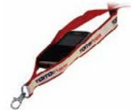
A29 Pouch for mobile phone

Material: elastic band Available colors: individual Possible printing: Z1