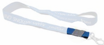
A40 Metal clip

Material: Plastic + metal Width (mm): 25 Capacity: 1 GB - 16 GB