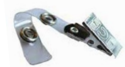
A42 Metal clip with silicon

Material: Metal + silicon Width (mm)/ size: 10 Available colors: silver + transparent Possible printing: none