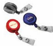
A28 Ski pass

Material: metal + plastic Width (mm)/ size: 5 Available colors: Individual Possible printing: Z2