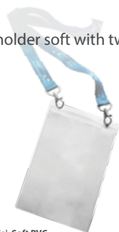
A34 ID holder soft with two holes

Material: Soft PVC Inner size: around 90x60 mm , Lead time: 1 day Other size are available , Lead time 2-3 day Color: Transparent Possible printing: Z2