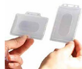
A31 ID holder hard

Material: Hard PVC Inner size: around 55x80 mm Available colors: Transparent Possible printing: Z2 Lead time: 1 day