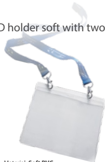
A33 ID holder soft with two holes

Material: Soft PVC Inner size: around 90x60 mm , Lead time: 1 day Other size are available , Lead time 2-3 day Color: Transparent Possible printing: Z2